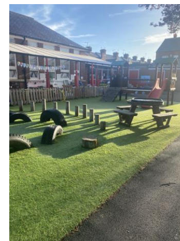
Our outdoor area