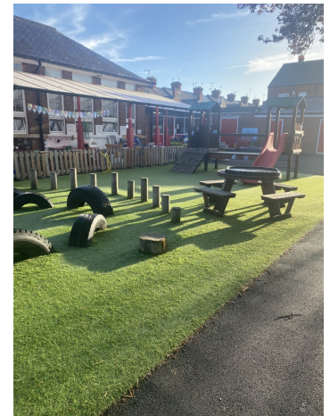
Our outdoor area