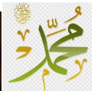
Muhammad (peace be upon him)