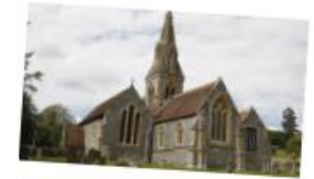
Place of Worship Christian people worship in a church.