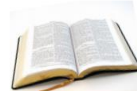
Religious Text The religious text used by Christians is called The Bible.