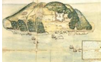
Pirate Den: Tortuga